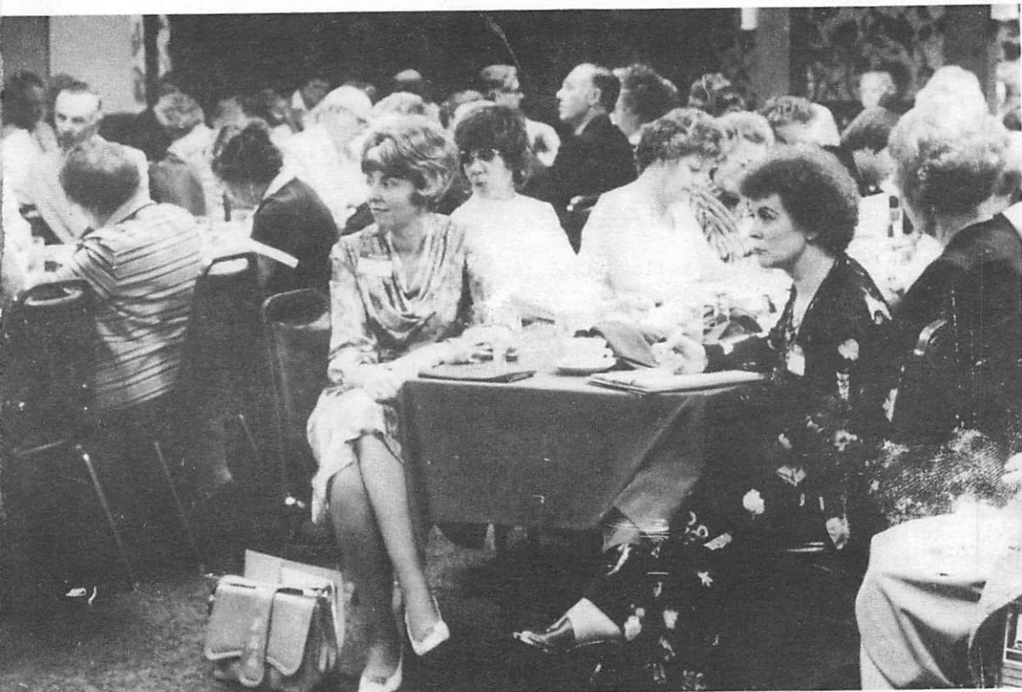
Timbertown Log Staff