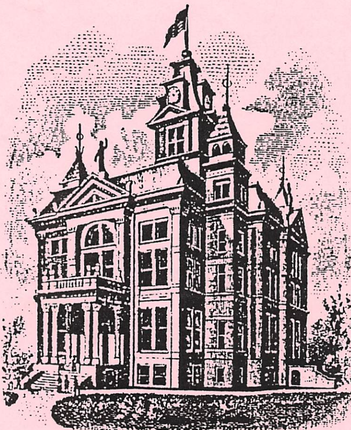
SAGINAW COUNTY COURTHOUSE