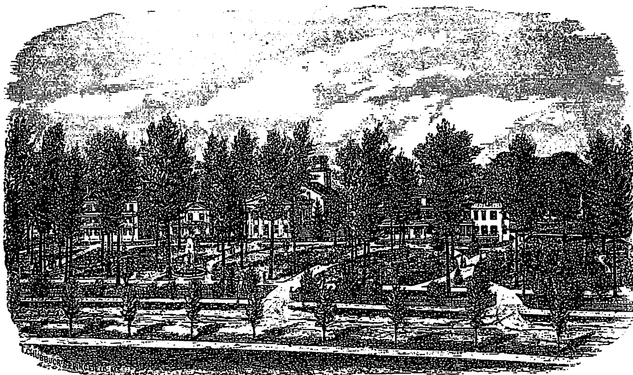
MAPLEWOOD INSTITUTE, PITTSFIELD, MASS.