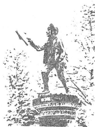
Newsboy Statue, Great Barrington