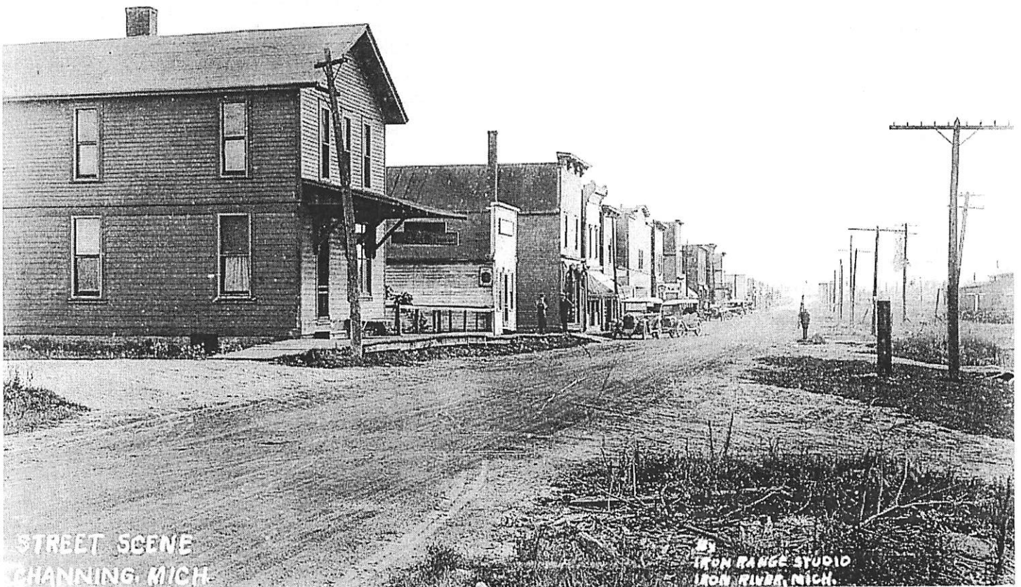
STREET SCENE CHANNING MICH.